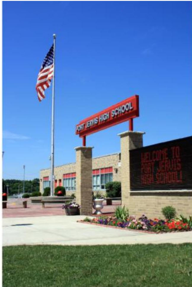
Parent's Handbook 2013-2014